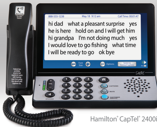
Hamilton® CapTel® 2400i

Furthermore, Captioned Telephone emerges as a vital tool in bridging communication gaps for people with hearing loss, offering them an enriched communication experience. As we move forward, it is imperative to prioritize and promote meaningful conversations to combat social isolation and foster holistic well-being among older adults and veterans alike.