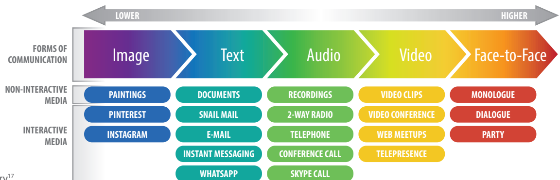
Figure 1. Media Richness Theory 17